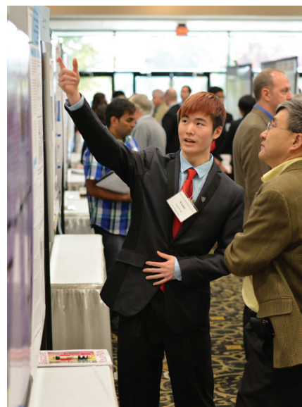
A 2013 research conference participant discusses his presentation.

Registration for both events opens August 1.